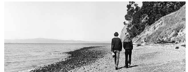
Strolling along Point Pinole's bluff-bounded western shoreline.