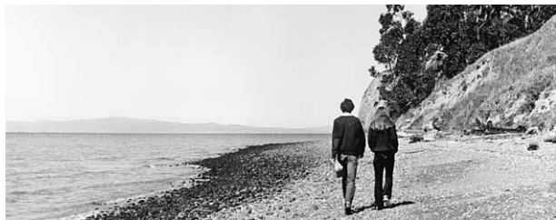
Strolling along Point Pinole's bluff-bounded western shoreline.