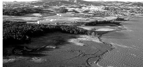
Point Pinole's Whittel Marsh (foreground) is home to the salt marsh song sparrow and salt marsh harvest mouse.